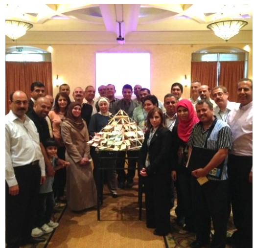
A completed Pyramid workshop in Aqaba, Jordan, Nov 2013, with government officials from five countries. The Pyramid has been used in dozens of countries, by large companies, cities, schools, universities, and governments.

The conclusion of the workshop involves making a commitment to implementation, which is symbolized by the Capstone of the Pyramid.